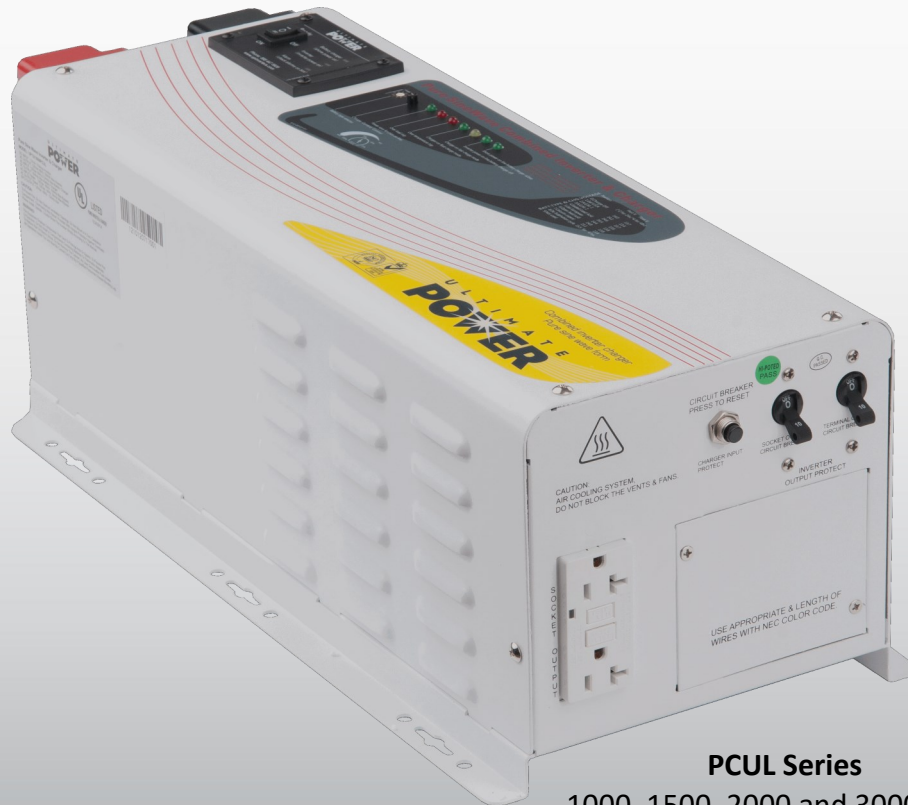
PCUL Series 1000, 1500, 2000 and 3000 Watts

Manufacturer of Inverters, Battery Management Devices & Lithium Batteries