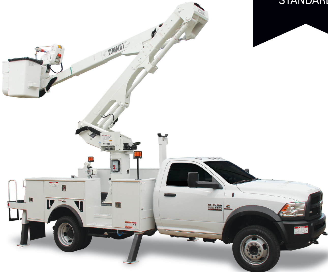
VST-47-I shown with Material Handling option.